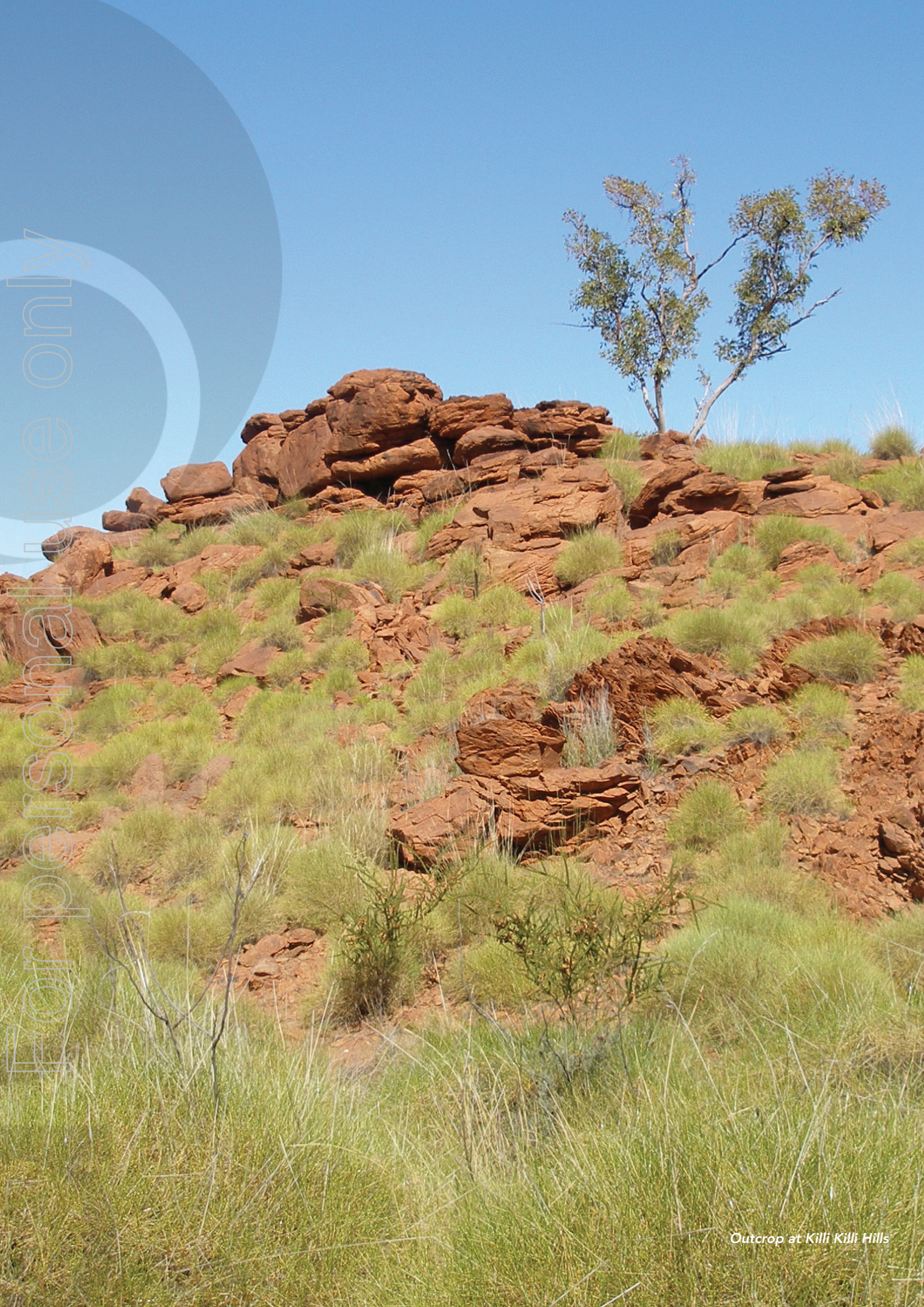
Outcrop at Killi Killi Hills