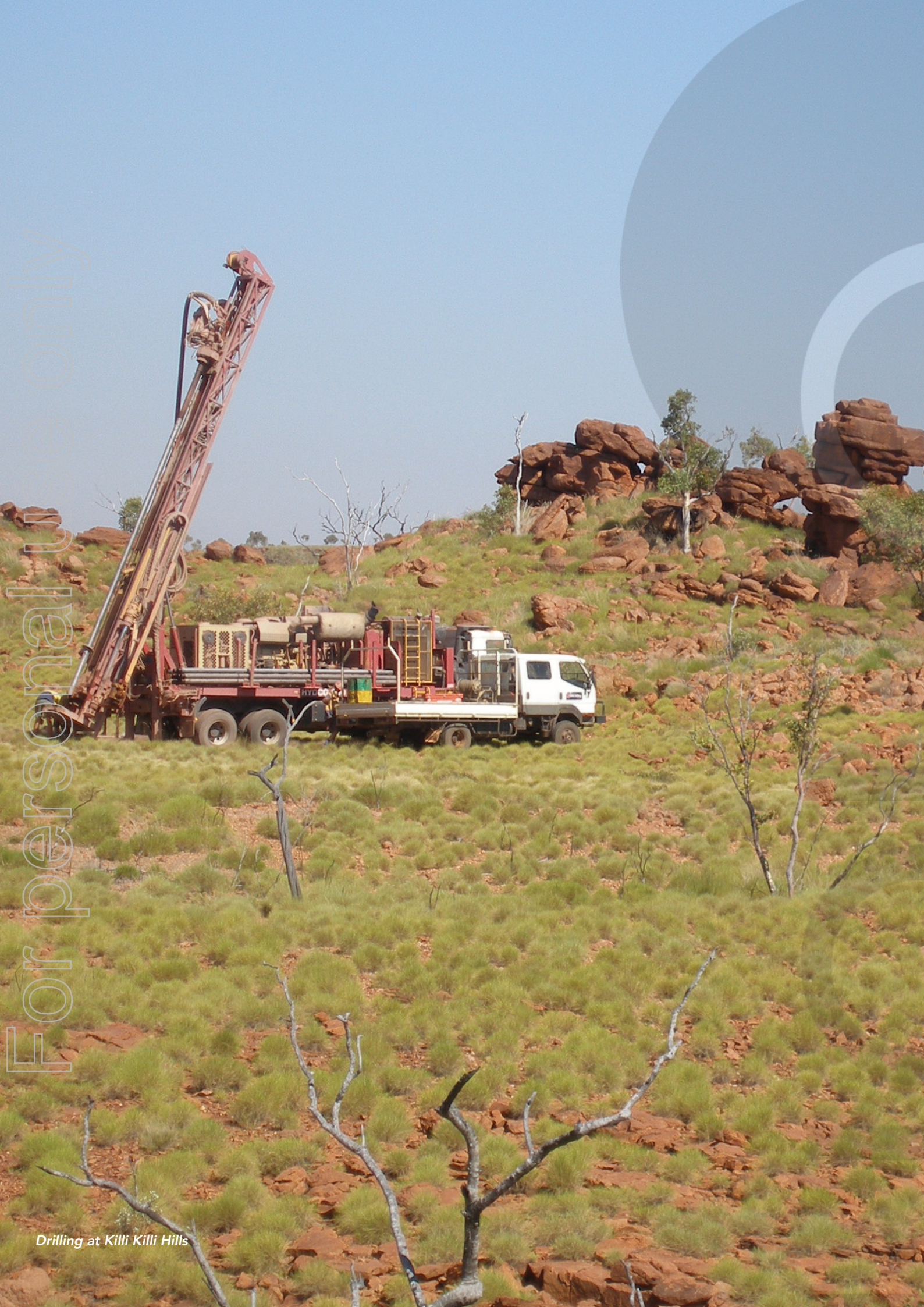
Drilling at Killi Killi Hills